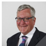
Fergus Ewing Scottish National Party