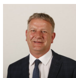
Deputy Convener David Torrance Scottish National Party