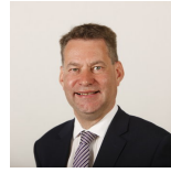
Deputy Convener Murdo Fraser Scottish Conservative and Unionist Party