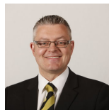
Stuart McMillan Scottish National Party