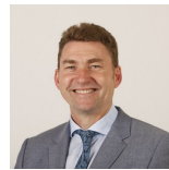
Brian Whittle Scottish Conservative and Unionist Party