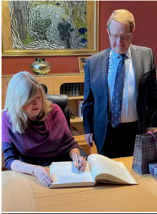
Rt Hon Alison Johnstone MSP and Speaker Birgir Ármannson MP