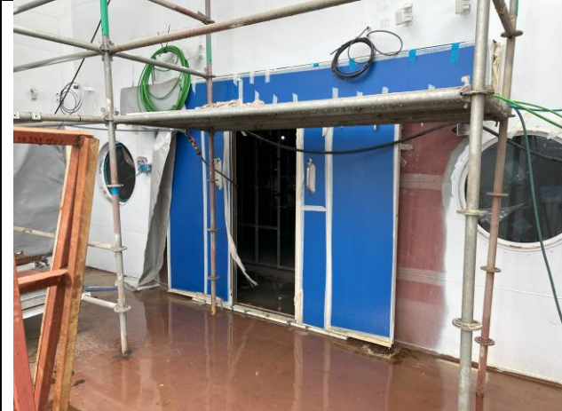
Passenger External Doors