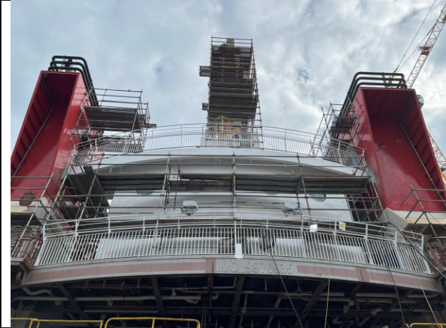
Aft Accommodation External