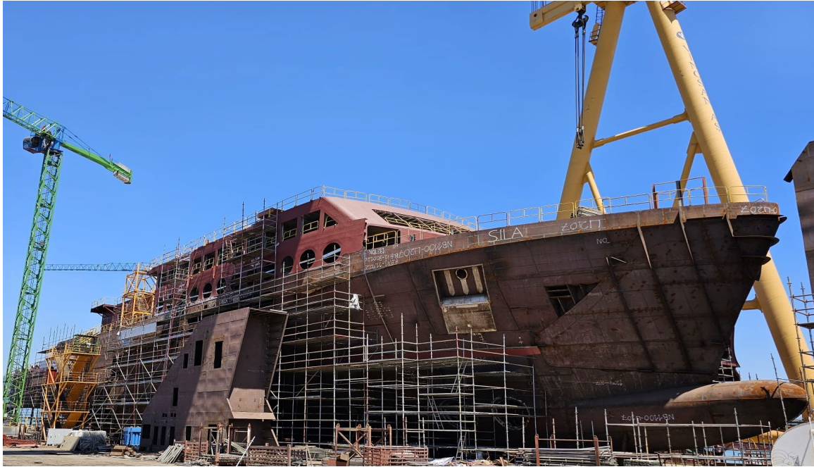
NB1101 Block Construction Underway