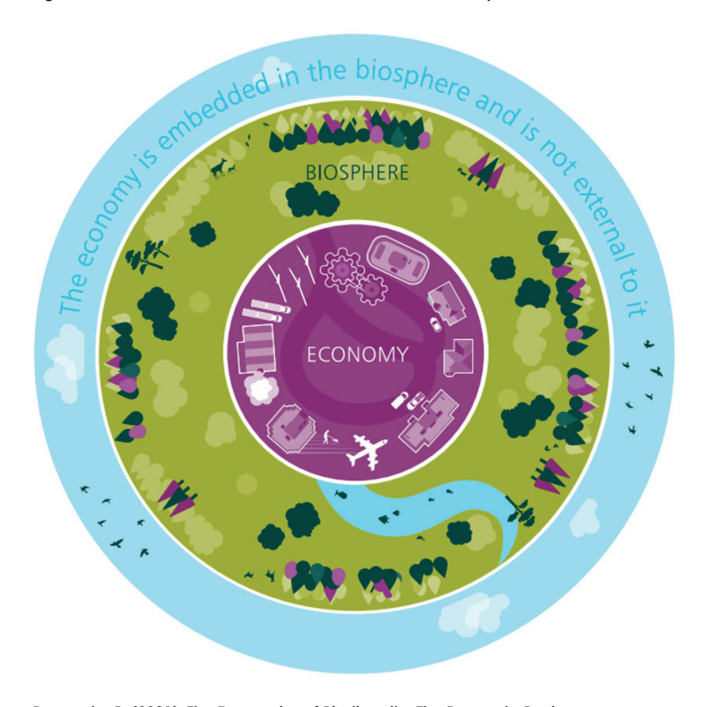
Figure 4: An illustration of the embeddedness of our economy in nature

Dasgupta, P. (2021), The Economics of Biodiversity: The Dasgupta Review. <a href="Abridged Version"><u>Abridged Version</u></a>. (London: HM Treasury). Licenced under the <a href="Open Government Licence"><u>Open Government Licence</u></a>