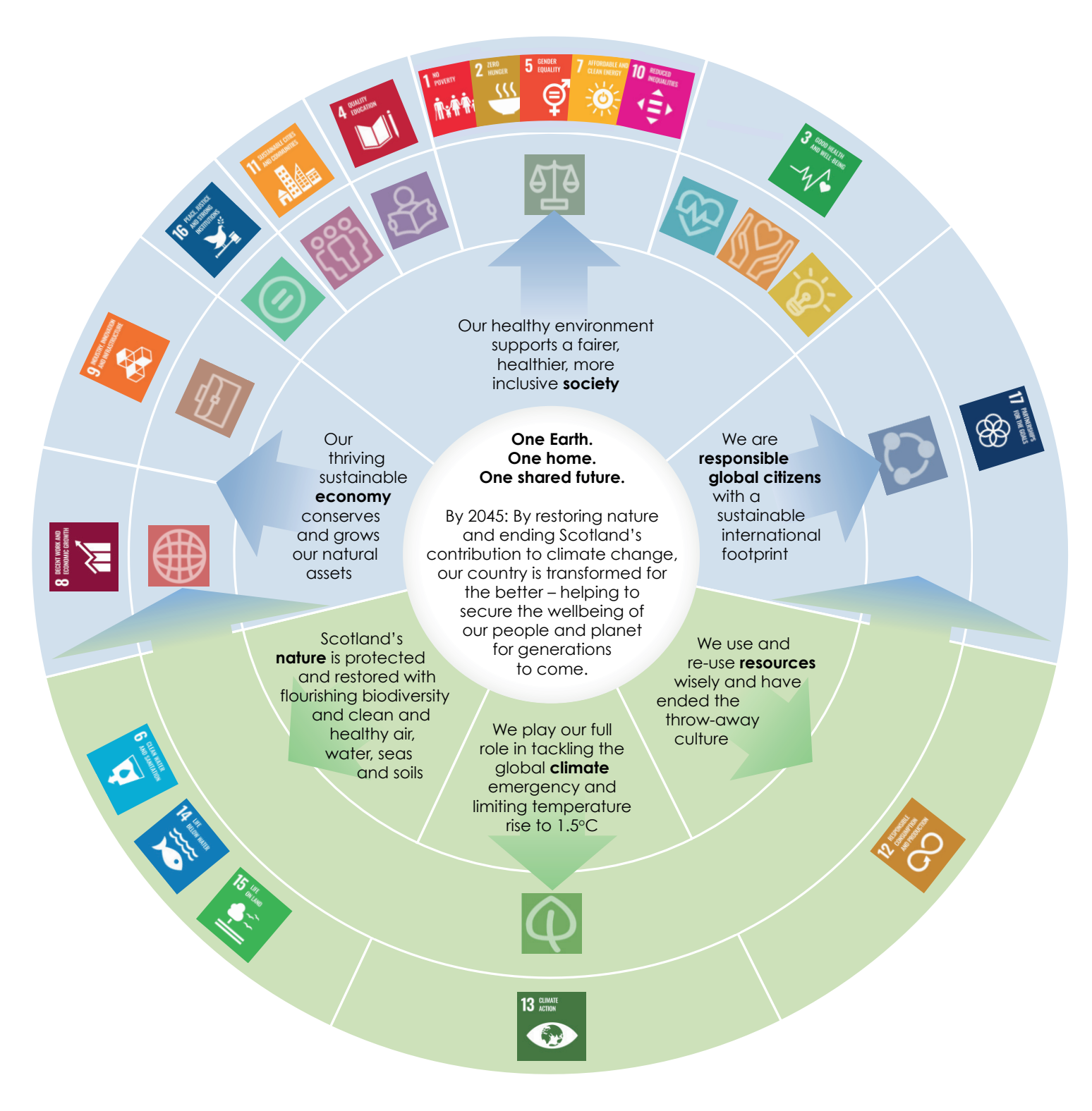
Figure 2: Contribution of the Environment Strategy vision and outcomes to National Outcomes and UN Sustainable Development Goals