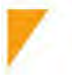
Figure 1: RTI mean pay, annual (12 month on 12 month) growth