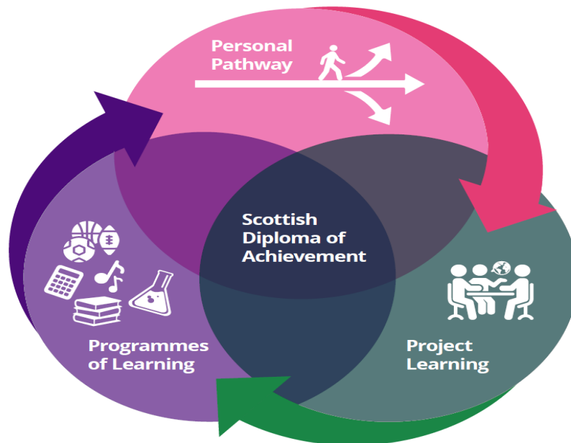
Figure 3: The Scottish Diploma of Achievement

The Diploma has been designed to reflect more of what we value in learning and what will be of greater value to learners as they move forward in their lifelong learning journey. It offers learners the opportunity to have a broader range of achievements recognised, all crucial for their future successful progression.