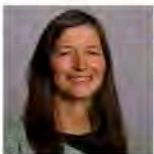
Ariane Burgess Scottish Green Party