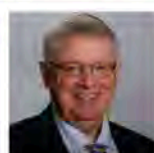
Martin Whitfield Scottish Labour