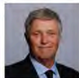
Edward Mountain Scottish Conservative and Unionist Party