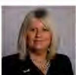
Sue Webber Scottish Conservative and Unionist Party