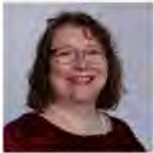
Clare Adamson Scottish National Party