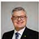
Stuart McMillan Scottish National Party