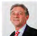
Richard Leonard Scottish Labour