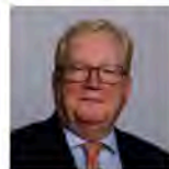
Jackson Carlaw Scottish Conservative and Unionist Party