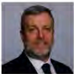
Finlay Carson Scottish Conservative and Unionist Party